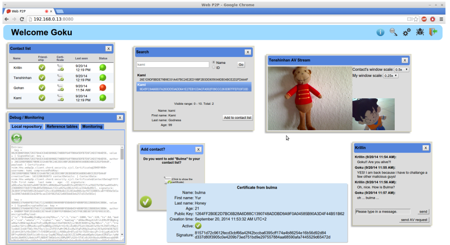
Fig. 2. Window-based GUI

ability to send encrypted messages by using the receiver's public key and create a signature, which the receiver can verify. To support user search in the Chord ring, we introduced self-signed certificates which each peer has to store at well-defined places in the DHT. So the user search is equivalent to the search of a user's certificate. An implemented access control mechanism of the DHT entries ensures that for example none of the certificates are overridden by unauthenticated users.